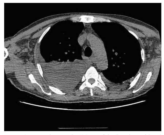
Figure 1. Computerized tomographic (CT) scan of the chest showing bilateral pleural effusion which was more pronounced on the right.

A 56-year-old male patient, who was diagnosed with hemophilia A nearly 3 years ago, was admitted to the emergency room with complaints of dyspnea. In his medical history he had twice experienced gastrointestinal tract and multiple intra-articular bleeding. Two months previously he had been hospitalized for gastrointestinal bleeding and admitted to a medical intensive care unit. The patient received factor 8 and erythrocyte suspension and was moved to the intensive care unit after 5 days. At emergency room admission his white blood cell count (WBC) was 11.5 x 10<sup>3</sup>/µL, hemoglobin: 11.1 mmol/L, platelet: 200 x 10^3/\mu L , partial thromboplastin time (PTT): 83 seconds, prothrombin time (PT): 20 seconds and international normalized ratio (INR): 1.03. The patient had no history of trauma. A computerized tomographic (CT) scan of the chest showed bilateral pleural effusion which was more pronounced in the right lung (Figure 1). Abdominal ultrasound showed free fluid between